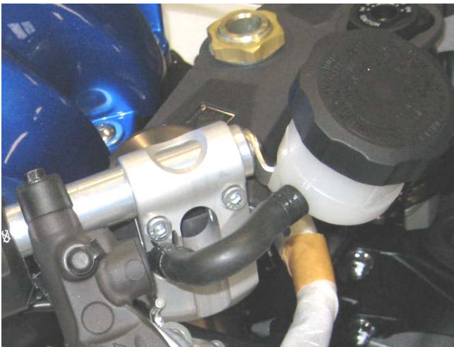
View from above!

Tighten the reservoir bracket with the outside bolt until it sticks firm in the tube. Don't try to tighten the bracket with too much torque until the bolt is blocked, the clamping rubber would be destroyed!